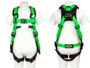
BuckOhm™ TrueFit™ w/ Dielectric D-Ring U68L7N05