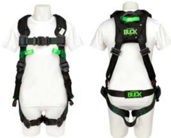
BuckOhm™ TrueFit™ w/ Web Loop U68L7N03