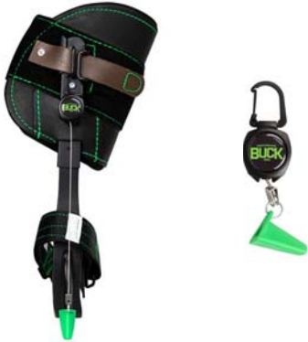
BuckGuard™ Retractable Gaff Guard (Set of 2) 6910