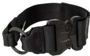
Buck FastStrap™ Quick Connect Foot Straps 214 02