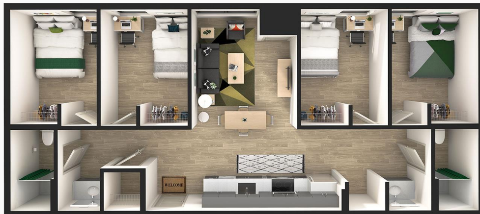
3D model of Lakeview unit.

Kitchen with a full-size fridge, stove & dishwasher Large closets in the bedroom(s) and hallway area Couch, coffee table, end table, TV console, kitchen table with chairs Full bed, dresser, desk and desk chair in bedroom Bedrooms are 12' 6 7/8" by 9' 1.5"